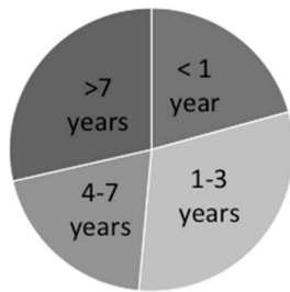
Approximately how long have you been a member of CUPE 3912? (140 respondents)

Survey respondent positions held (some respondents indicated more than one position):