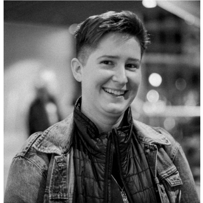
Musqueam/Squamish/Tsleil-Waututh territories (Vancouver, Canada), 2019.

They are a member of the SMU PT Faculty Mobilization Committee.